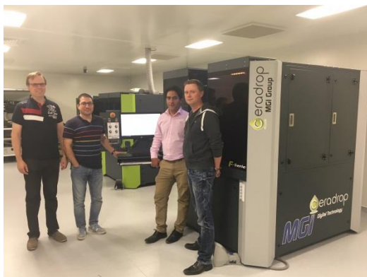
Successful first on-site experiments